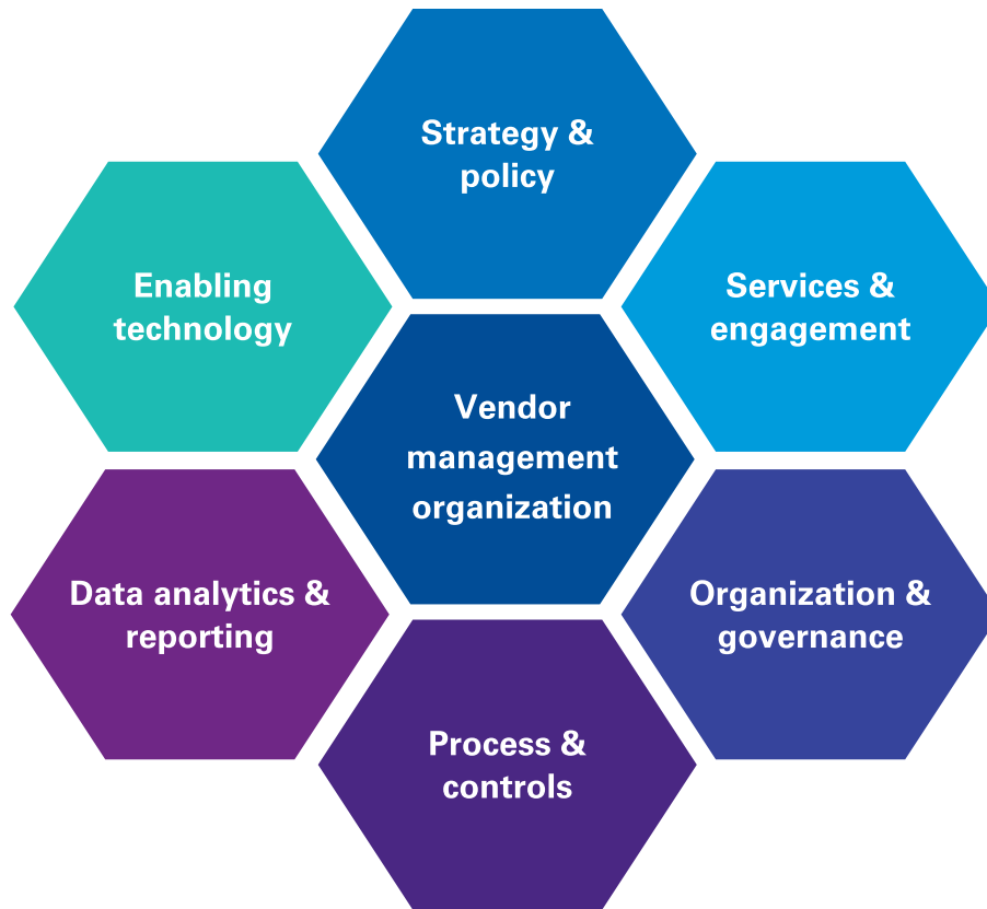
Figure 1 – the foundational components required to execute an effective and efficient VMO operating model