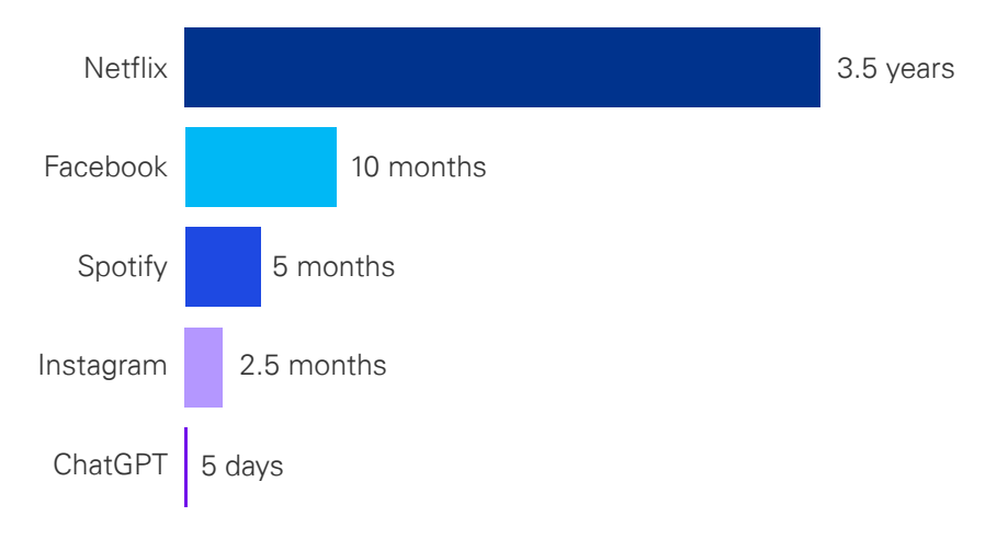
Exhibit 1: Racing to one million ChatGPT hit one million users in record time